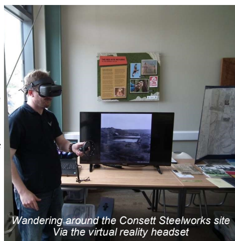
Wandering around the Consett Steelworks site Via the virtual reality headset

https://www.buildingselfbelief.org/what-we-do/projects/consett-iron-company-community-heritage-project